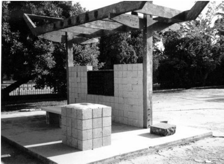
Above: Chinese Memorial lot, East 6th and Tulare Streets

Wah did not have resources to protect and maintain the grounds. 30 Some members objected to removal of remains, but Holden offered them more, and practical voices prevailed. 31 An agreement was concluded, and Holden's attorney petitioned Judge Lambert for a land-use change, from cemetery to residential.