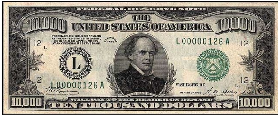
(New Series $10,000)

“Oh, shut up. That's got nothing to do with money. I mean all of the $1 bills will have Washington's picture on them, the $2 bills will bear Jefferson's picture, $5 for Lincoln's, $10 for Hamilton's, $20 for Jackson's, $50 for Grant's, $100 for Franklin's, $500 for McKinley's, $1000 for Cleveland's, $5000 for Madison's, and $10,000 for Chase's.”