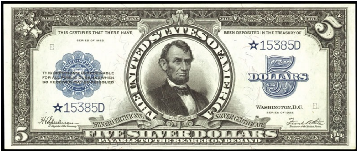
(Old Series 1923)

Our money is three inches wide and seven inches in length. Uncle Sam has started making a whole batch of new currency. It's 2-9/16 inches wide and 6-1/4 inches long, and this new money's going into circulation tomorrow." 2