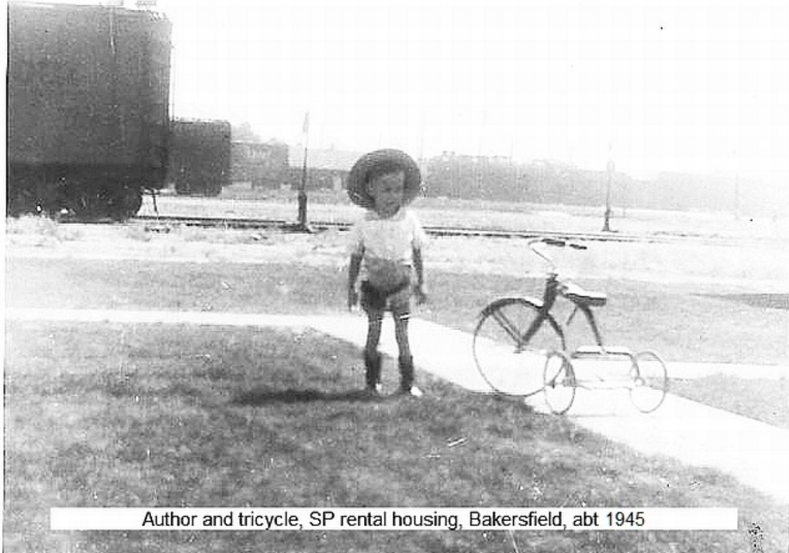
Author and tricycle, SP rental housing, Bakersfield, abt 1945

The flat-topped, probably prefabricated, rental houses started where Williams Street crossed the tracks and extended down to the ice house by the canal. The houses had grass lawns and flowers, and I never imagined that anyone lived in a nicer place than I did. There were lots of kids to play with, so what did I care?