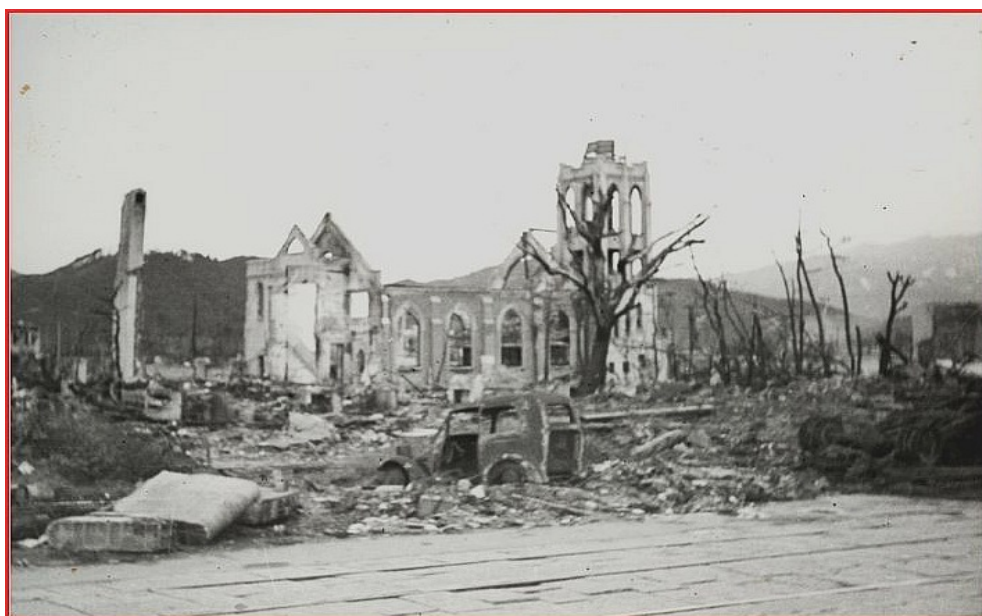
Hiroshima Catholic Church

artillery units, and many other units, made up combat teams for those operations. For the most part, the 41 st was in continuous combat from April 22nd until about August 20, 1945.