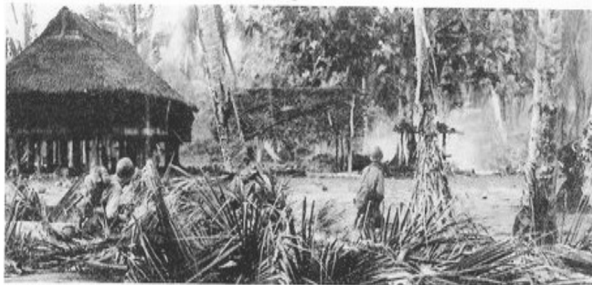
On Aitape where Pete was shot at by US troops

Naval bombardment and Air Force bombing and strafing of the landing area always preceded our landings. We were awakened about 3:00 AM to prepare for the landing. After breakfast we packed our gear and made preparations to climb down the side of the ship on rope ladders into the landing barges, which were bobbing up and down on the ocean. After we were loaded the boats formed into the several waves to attack the island.